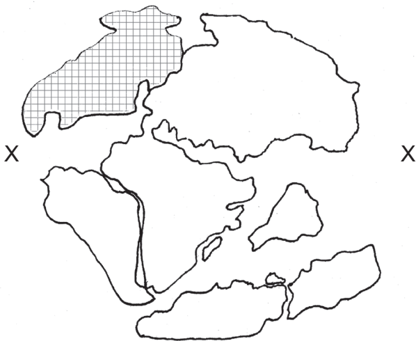
JURASSIC - 135 MYA