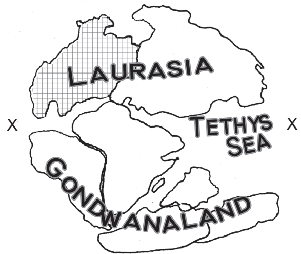
TRIASSIC - 200 MYA