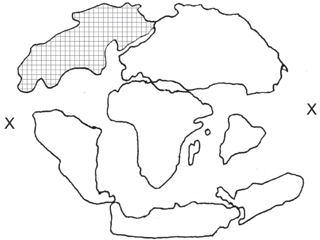
CRETACEOUS - 65 MYA