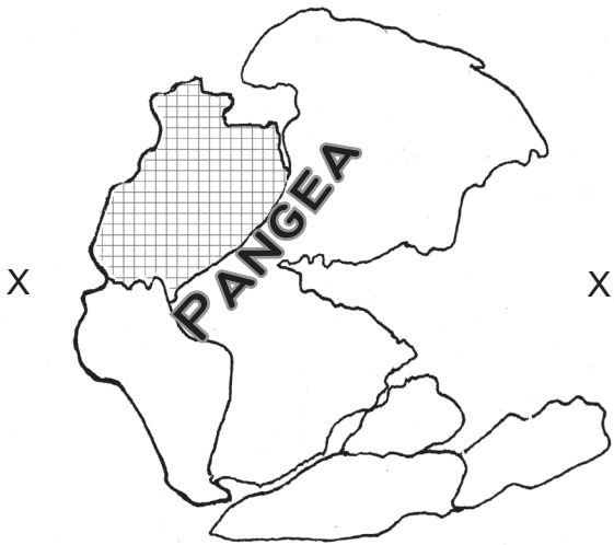
PERMIAN - 225 MYA