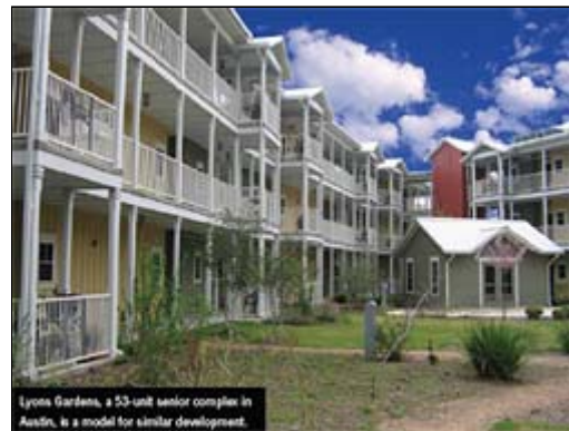
Lyons Gardens, a 53-unit senior complex in Austin, is a model for similar development.

The problem is compounded by the federal government's diminishing role in housing and community development programs. Local entities rely on federal assistance programs to buy down the cost of housing for low- and moderate-income residents. According to the Center on Budget and Policy Priorities (CBPP), because of budget deficits, the current administration and Congress have reduced funding for a number of domestic programs, including most low-income housing programs. Community development block grants, the Home Investment Partnerships Program and public housing have been hit the hardest; their funding declined by 20 percent, 16 percent and 11 percent, respectively, from 2004 to 2006. In 2007, the administration proposed further cutbacks of $1.3 billion. These decreases in large federal block assistance programs have affected nearly every low-income housing grant program important to state and local plans to increase affordable housing. And as federal funding declines, construction costs continue to rise.