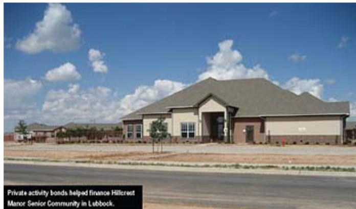
Private activity bonds helped finance Hillcrest Manor Senior Community in Lubbock.

State and local jurisdictions can raise revenue through the sale of tax-exempt private activity bonds (PABs), which can be used to finance affordable multifamily developments or provide funds for low- and moderate-income homebuyer mortgage assistance. PAB funds can also be used for public programs, such as airports, sewers, industrial parks and student loans. States are allotted a debt limit for such bond issuances. The 2006 limit was $85 per state resident, a $5 increase over 2005. According to the Texas Bond Review Board, this raised Texas' 2007 cap to just under $2 billion, an increase of almost $170 million from 2006. Half of the allocation goes to local and state multifamily and single-family mortgage programs and half to other public needs.[3]