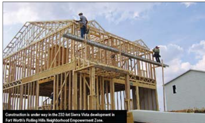
Construction is under way in the 232-lot Sierra Vista development in Fort Worth's Rolling Hills Neighborhood Empowerment Zone.

The Fort Worth City Council was the first to take advantage of this legislative tool by establishing a neighborhood empowerment zone program in 2001 to promote private investment in housing and businesses. [4] To be designated such a zone, the area must have a plan to promote the creation or rehabilitation of affordable housing and increase economic development activity.