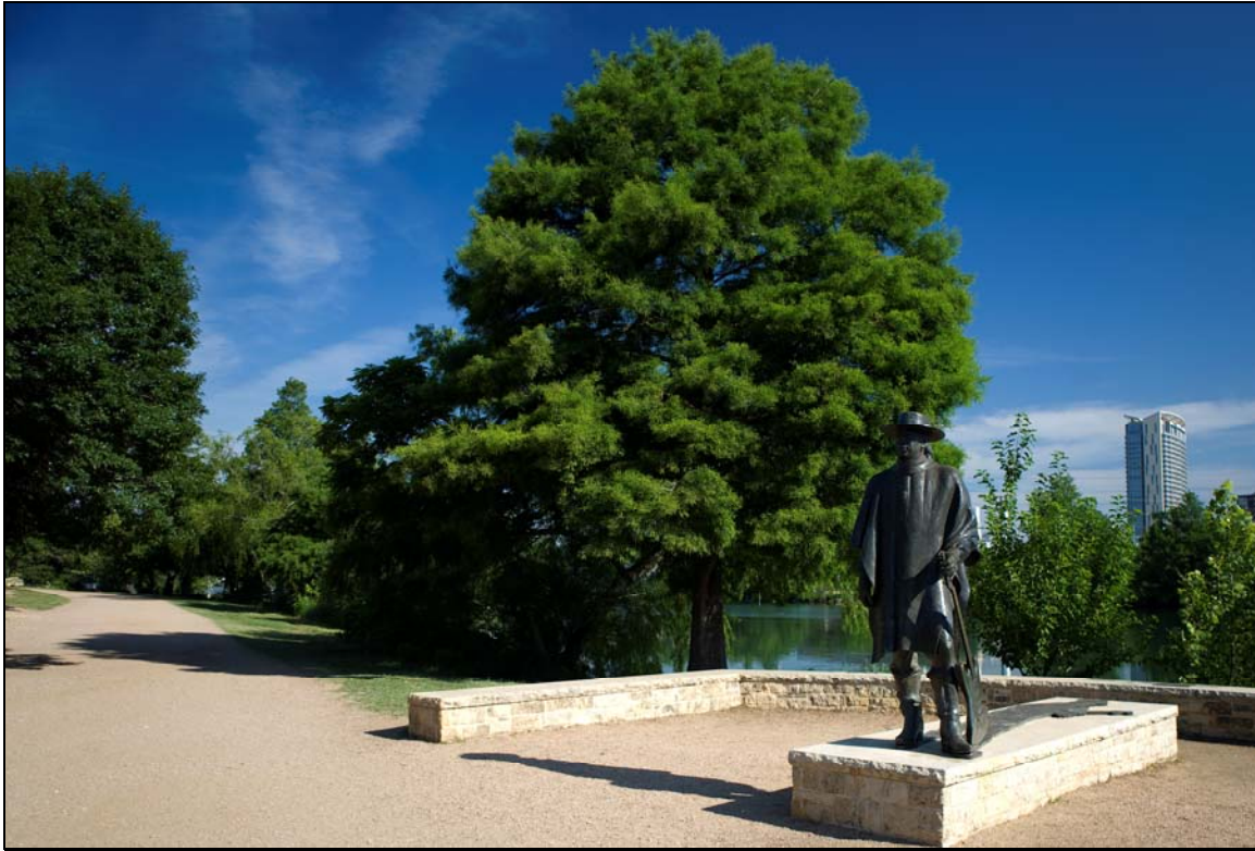
Town Lake, Austin TX.

Join us in Austin TX for this important and no-cost training.